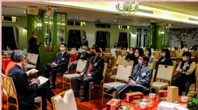
週年會員大會於二零二一年十一月舉行 The Annual General Meeting held in November 2021