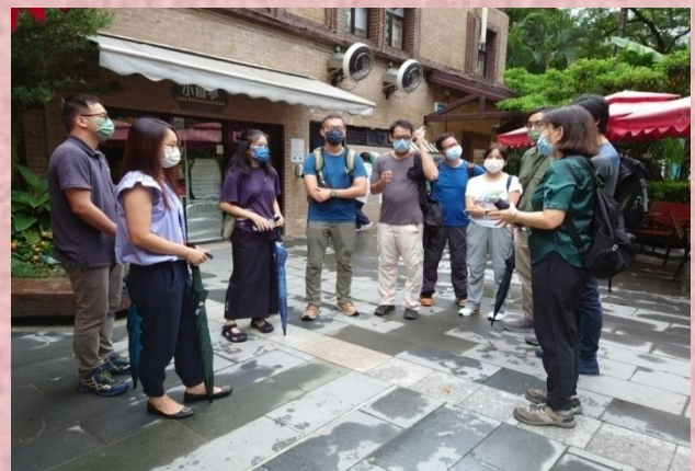
課程亦安排實地視察以增進學員的體驗 The Course also included site visits to enrich students' experience