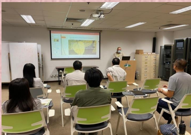
課程內容特別設計以切合香港濕地公園的需要 The Course was specially designed for the HK Wetland Park