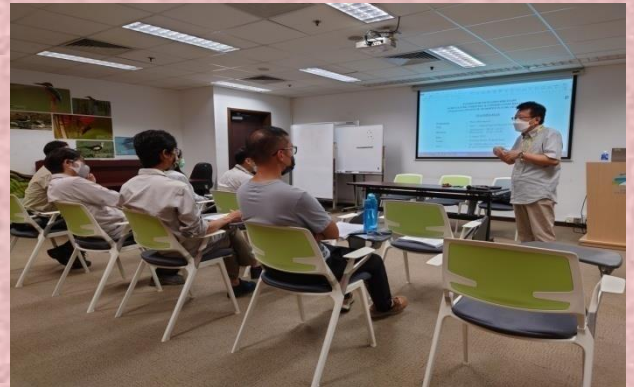
本會導師教導學員園藝知識 Our Tutor conducting the Class