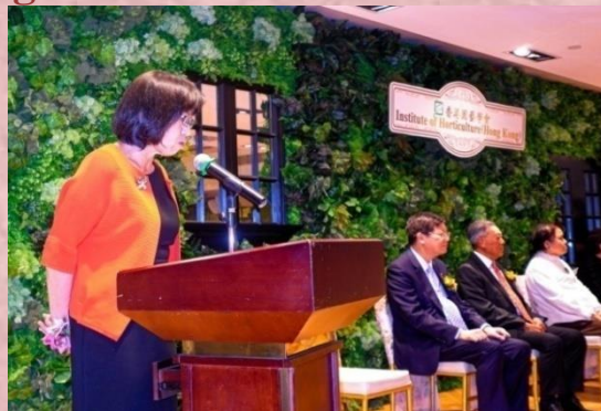
主席致歡迎辭 Welcoming Speech by the Chairman