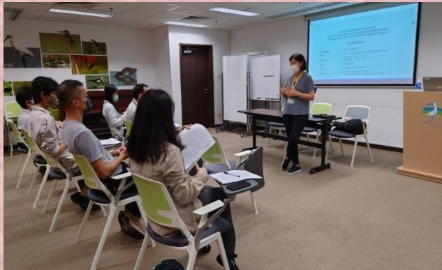
會長向學員介紹課程大綱 Our President introduced the Course content to Students