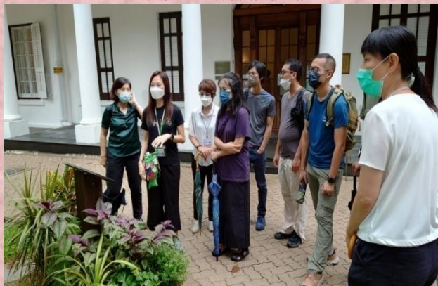
課程亦安排實地視察以增進學員的體驗 The Course also included site visits to enrich students' experience