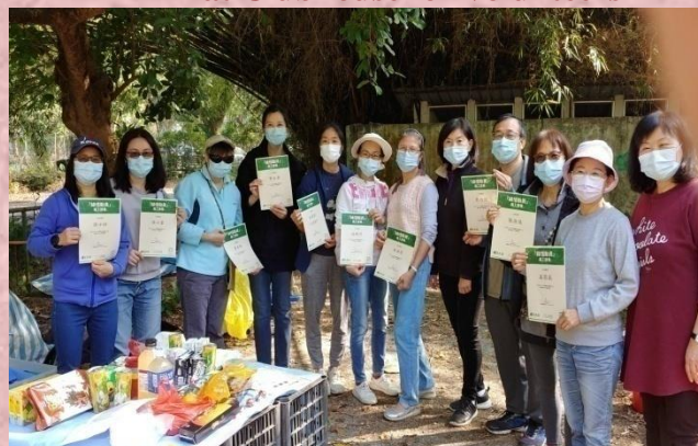
向義工頒授證書以表揚他們的努力 Presenting Certificates to the Volunteers for their effort in the Scheme

Organised Jointly with Tai Po District Community Green Station on-line horticultural courses and workshops/planting activities at Clubhouse for Volunteers