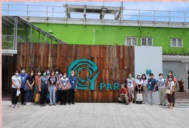
與參加活動者合照 Group photo with participants