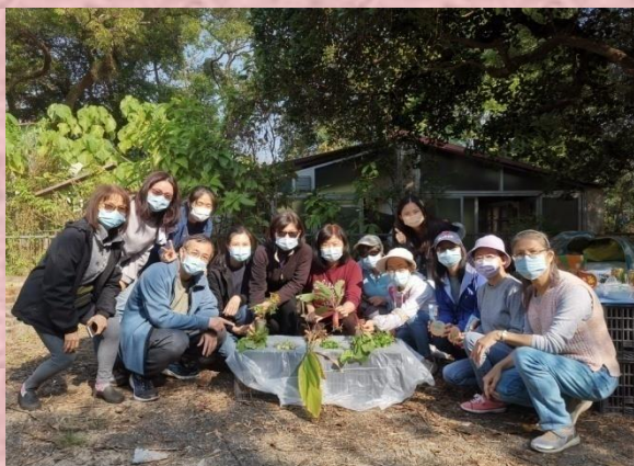
活動義工合照及分享農耕的收穫 Group Photo with Volunteers of the Planting Activity at the Clubhouse