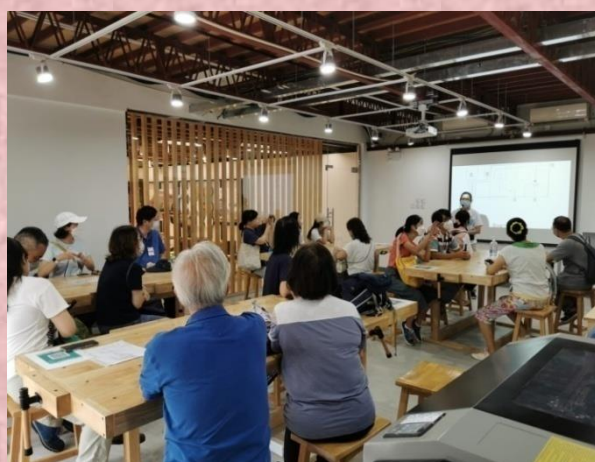
參加者積極參與活動 Participants actively joining the event