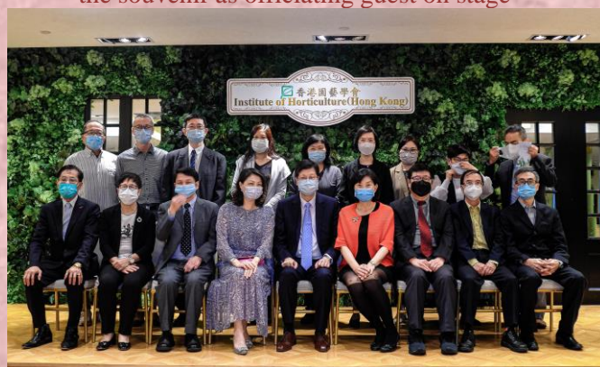
現任理事與名譽會長及名譽會員於會後合照 Group Photo of Council Members, Hon. President and Hon. Member after the event.