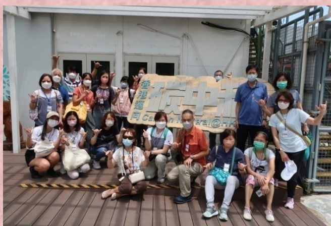
與參加活動者合照 Group photo with participants