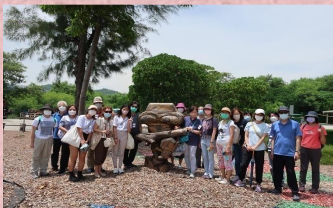
與參加活動者合照 Group photo with participants