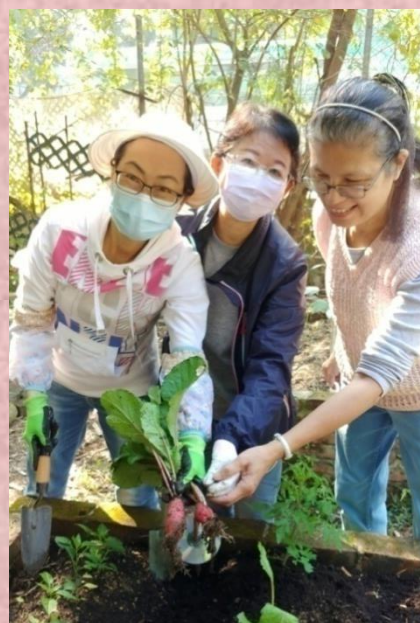
活動義工分享農耕收穫的喜悅 Volunteers sharing the joy of their harvest