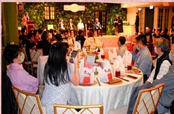
週年晚宴於沙田水中天舉行 The Annual Dinner was held at ClubOne, Sha Tin