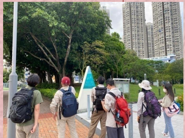
課程亦安排實地視察以增進學員的體驗 The Course also included site visits to enrich students' experience