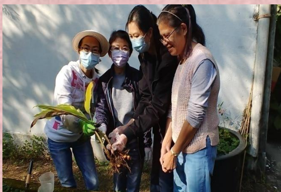
活動義工分享農耕收穫的喜悅 Volunteers sharing the joy of their harvest

Organised Jointly with Tai Po District Community Green Station on-line horticultural courses and workshops/planting activities at Clubhouse for Volunteers