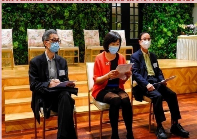
主席，秘書及財務司庫作出報告 The Chairman, Secretary and Treasurer reported at the meeting