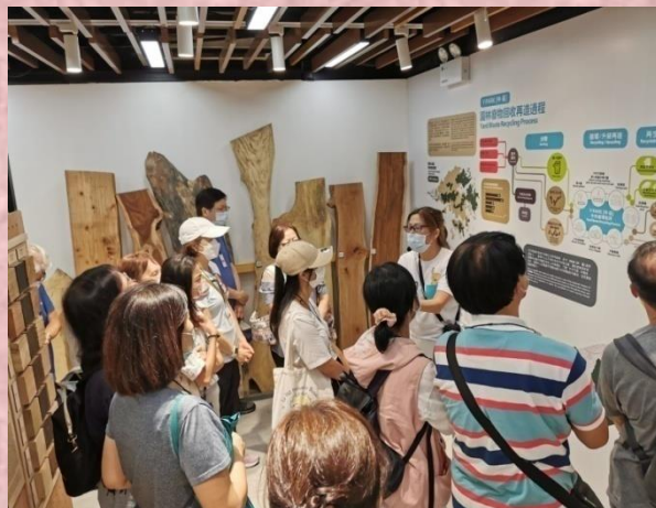
參加者積極參與活動 Participants actively joining the event