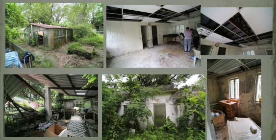
本會正向馬會尋求撥款作出維修 The Institute is seeking funds from HKJC for the renovation works