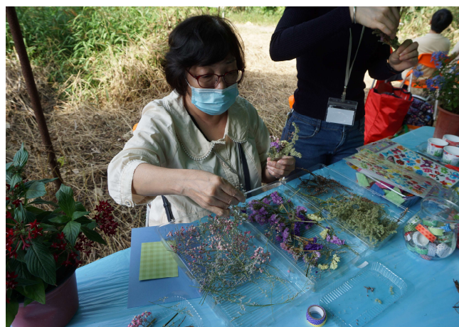
參加者積極參與活動 Participants actively joining the event