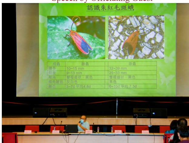
主講嘉賓進行演講 Talk delivered by Speaker