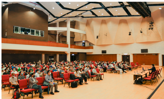
講座在新界鄉議局大樓大劇院舉行 The seminar was held at the Grand Theatre of HYKNT