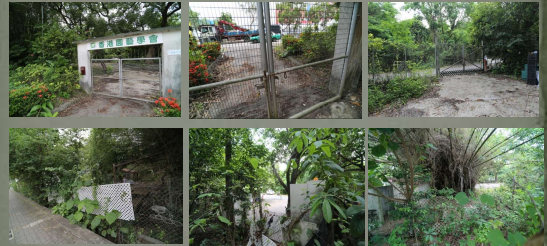
會址已使用多年大部份設施變得陳舊 The Club House has been used for years and most of the facilities become obsolete