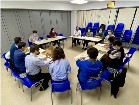
週年會員大會於今年四月舉行 The Annual General Meeting held in April 2021