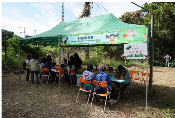
學會於活動設立攤位 Booth set up by the Institute at the Carnival