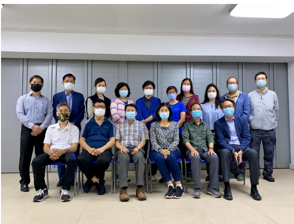
新一屆理事與會員合照 Group photo of Members and the New Committee