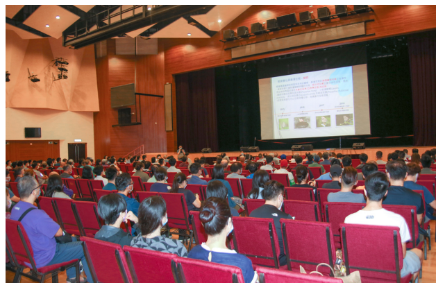
講座報名及出席人數踴躍 The Seminar was well received by the Participants