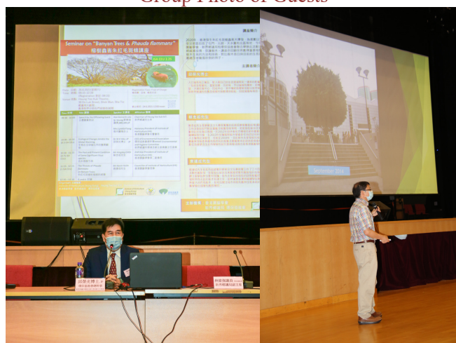
主講嘉賓進行演講 Talk delivered by Speakers