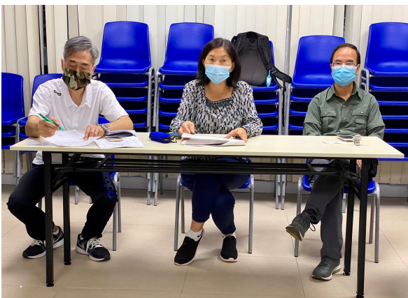
主席、秘書及財務作出報告 The Chairman, Secretary and Finance reported at the meeting