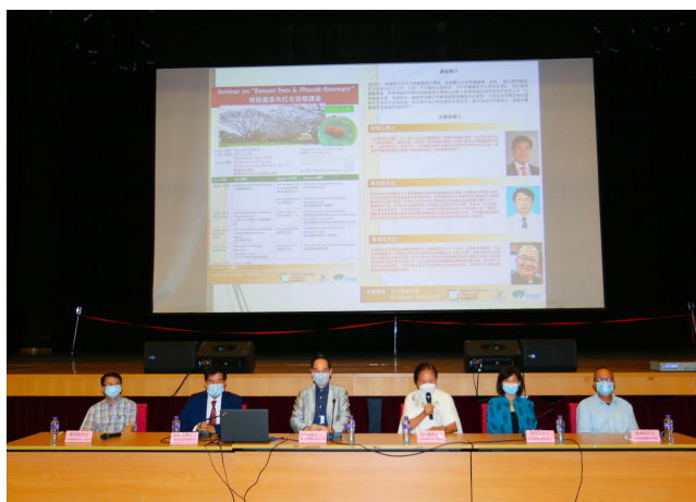
主禮嘉賓致詞 Speech by Officiating Guest