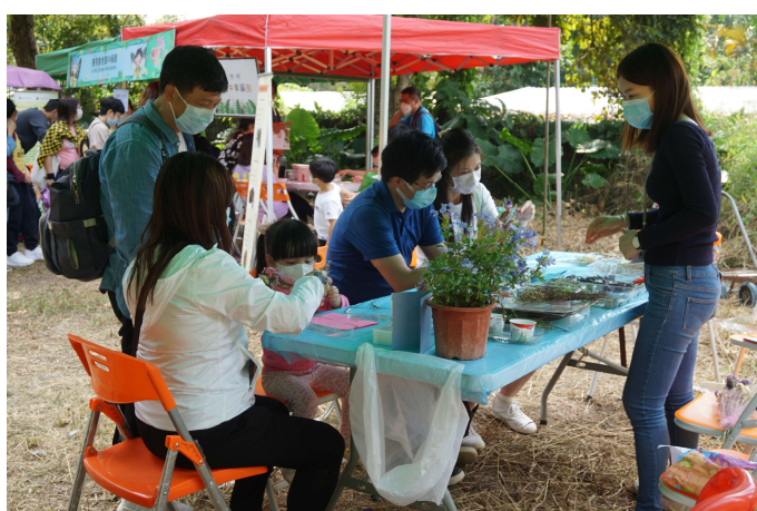
參加者積極參與活動 Participants actively joining the event