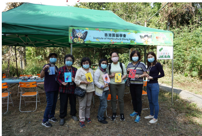
與參加活動者合照 Group photo with participants