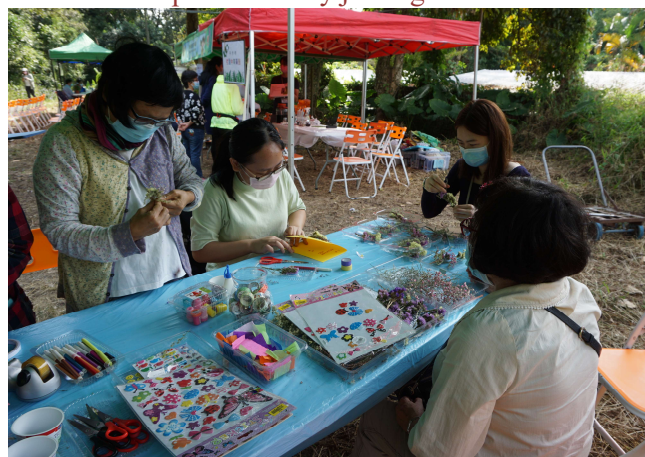
參加者積極參與活動 Participants actively joining the event