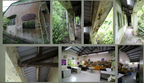
課室出現石屎剝落需進行整體維修 Cracks found at the concrete columns of the Classrooms and need major repair