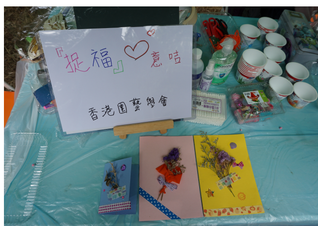
心意咭! Best Wishes!